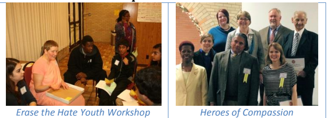
Erase the Hate Youth Workshop