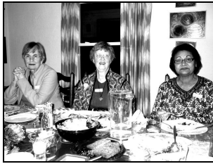
Tables of Eight 2009