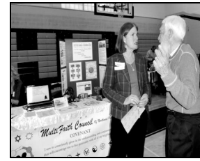
MFC in the community – Perrysburg Global Summit